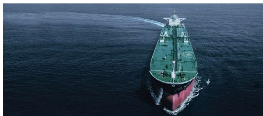
TEA TSAKOS – Megaron Macedonia, 367 Syngrou Ave., 175 64, Athens, Greece