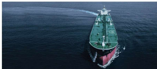
TEA TSAKOS – Megaron Macedonia, 367 Syngrou Ave., 175 64, Athens, Greece