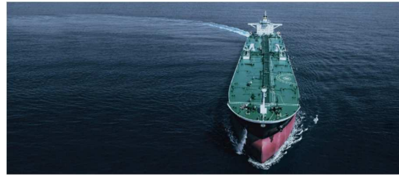
TEA TSAKOS – Megaron Macedonia, 367 Syngrou Ave., 175 64, Athens, Greece