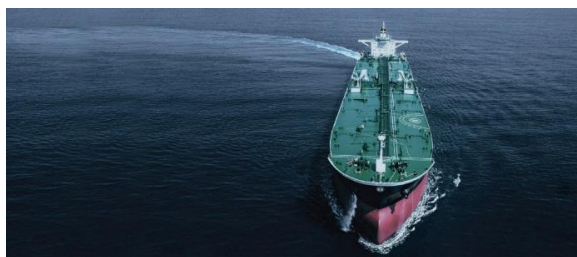
TEA TSAKOS – Megaron Macedonia, 367 Syngrou Ave., 175 64, Athens, Greece