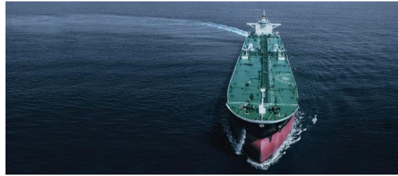
TEA TSAKOS – Megaron Macedonia, 367 Syngrou Ave., 175 64, Athens, Greece